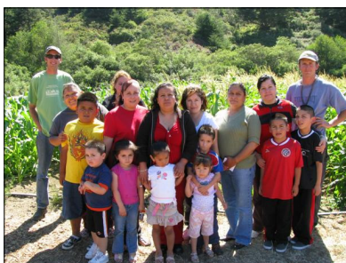
Ten Pescadero families received weekly boxes of organic produce.

Over 37 tons of food were distributed to nearly 15% of households in La Honda and Pescadero through Puente's monthly partnership with the Second Harvest Food Bank. Many men and women first come to Puente with only the clothes on their backs. Puente provides sleeping gear and clothing, welcome bags with phone cards and food coupons, and when needed, bicycles for transportation. Puente distributes furniture and child-related donations such as children's clothing and diapers. Puente also provides emergency financial aid for food, gas, utilities, medical/dental care, and rental assistance.