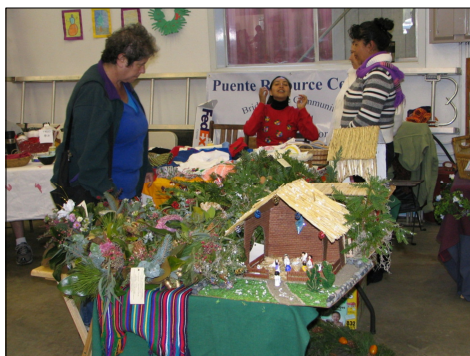
Pescadero Winter Fair, 2007.