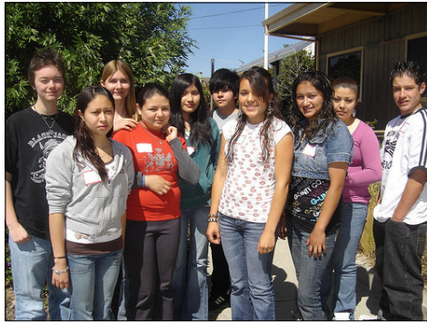
Puente's youth workers, 2008, nearly 10% of Pescadero High School.