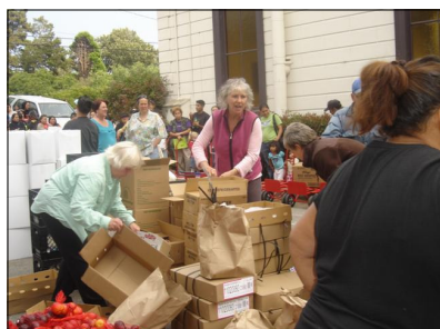
Puente distributes 37 tons of food each year in La Honda and Pescadero.