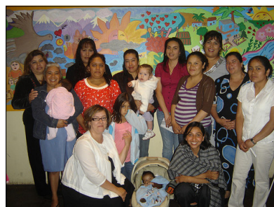
Participants in the Madres Project standing in front of their mural.

With the support of their CSA (Community Sponsored Agriculture) members, Blue House Farm provided weekly organic food boxes to 10 local families who work at the area's ranches and nurseries.