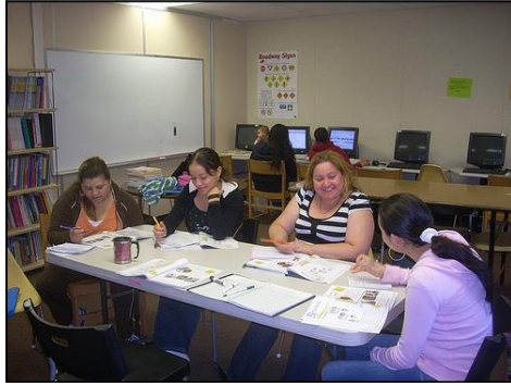
ESL for Moms continues to be one of Puente's most popular classes.