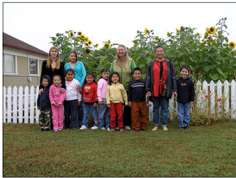
Kick-Off to Kinder program, 2007.