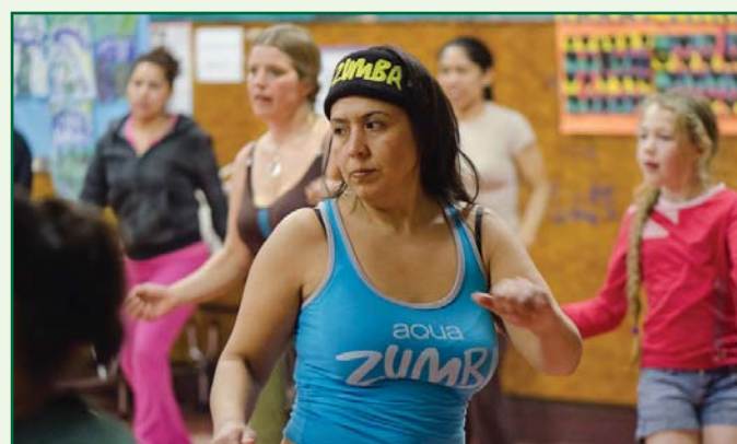
A Zumba class at Puente

Puente's expanded fitness program features Zumba, a popular Latin-inspired dance class that draws more than 30 teens, parents and retirees. Grant funding from the Bella Vista Foundation and Kaiser Permanente helped Puente train 3 licensed instructors and offer Zumba twice a week. "It gets me sweaty and my heart pumping!" exclaims one Zumba lover.