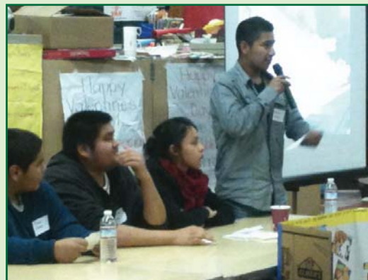
Students present their ideas for a mural at a public meeting