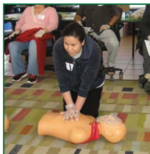
CPR training at Puente