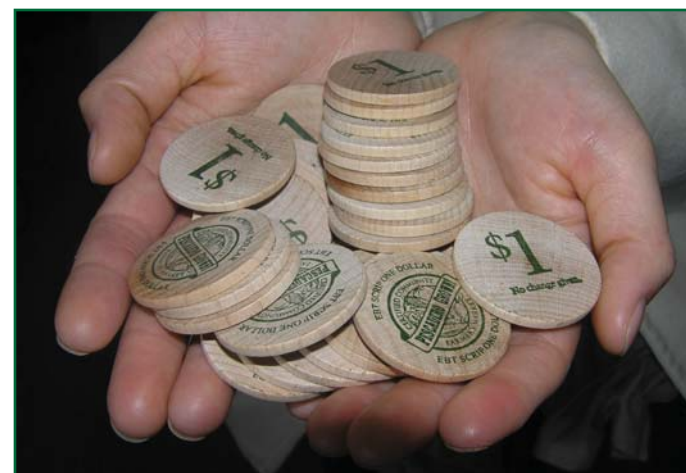
Puente's Tokens program gives produce discounts to qualifying shoppers