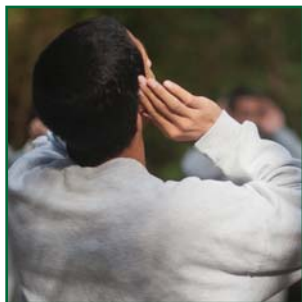
Camp Glenwood boys pause to listen to the sounds of nature

Puente created its Green Jobs Corps to better position the South Coast for long-term sustainability, and bring young people together to learn about careers in farming, food and the environment. We underwrote the costs of a semester-long Environmental Field Studies course and a Green Career Fair at Pescadero High School. A