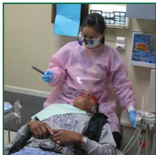
Farmworkers receive free dental care