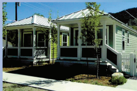
Example of Affordable Housing Ejemplo de vivienda de bajo costo

Pescadero Planning Initiative: Town Planning Gathering March 17, 2019